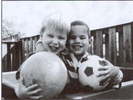
Scene as viewed by a person with normal vision.