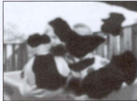
Scene as viewed by a person with diabetic retinopathy.