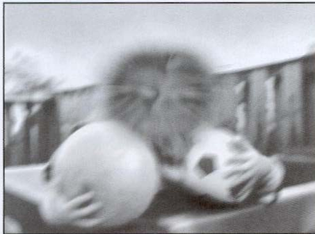
Scene as viewed by a person with age-related macular degeneration.