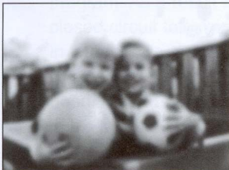
Scene as viewed by a person with cataract.